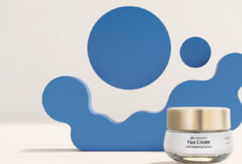
Face Cream with Hydrating Factors 50ml