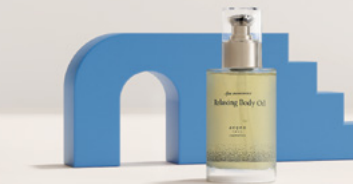
Relaxing Body Oil 100ml

The relaxing experience lasts longer with our Relaxing Body Oil containing lavender essential oil, which relieves from tension, muscular aches and brings harmony to all your senses.