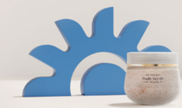
Body Scrub 200ml

Treat yourself to the ultimate revitalisation experience with our Body Scrub with Cretan Herbs such as dictamnus and sage, which will remove dead skin cells and leave your skin so soft like velvet.