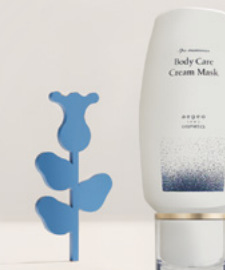
Body Care Cream Mask 200ml

Offer a valuable gift of hydration and rejuvenation to your body with Body Care Cream Mask, with organic olive oil, aloe and hyaluronic acid and feel your skin more calm, smooth and radiant.