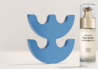
Face Serum 30ml