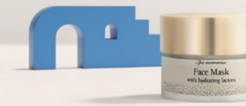
Face Mask with Hydrating Factors 50ml

Gentle exfoliation of the face with loofah, olive oil and grape oil, specially designed for even the most sensitive skin, removes dead cells, deeply cleanses the skin leaving it radiant and clean.