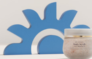
Body Scrub 200ml

Treat yourself to the ultimate revitalisation experience with our Body Scrub with Cretan Herbs such as dictamnus and sage, which will remove dead skin cells and leave your skin so soft like velvet.