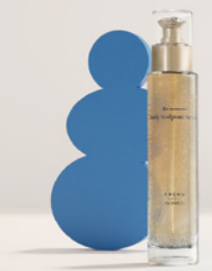
Body Sculpture Serum 100ml

Sculpt your body's firmness with our Body Sculpture Serum enriched with artichoke extract, which helps smooth out orange-peel skin and lose inches. You can combine the serum with any of the other products of the weight-loss cruise to maximize results.