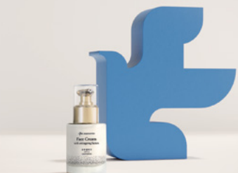
Face Cream with antiageing factors 50ml

Bring out the beauty and radiance of your face with our Face Cream with Anti-aging Factors with organic olive oil and saffron, known for their rich antioxidant and anti-aging properties.