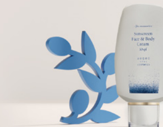
Sunscreen face & body 30 spf 150ml