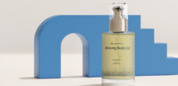
Relaxing Body Oil 100ml